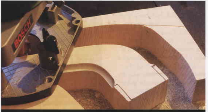
A close-up view of the flutes in the pillar being routed. The offcuts from the sides of the pillar help to support the router and prevent it from rocking.

notes must have increased. At some point lowering the neck would have become more practical than further increasing the number of strings, a process which ultimately would have led to an instrument of unmanageable proportions. The only other option was beyond reach at the time, needing today's skilful engineering to add semitone levers to make the equivalent of a modern harp, which is capable of playing up to six and a half octaves.